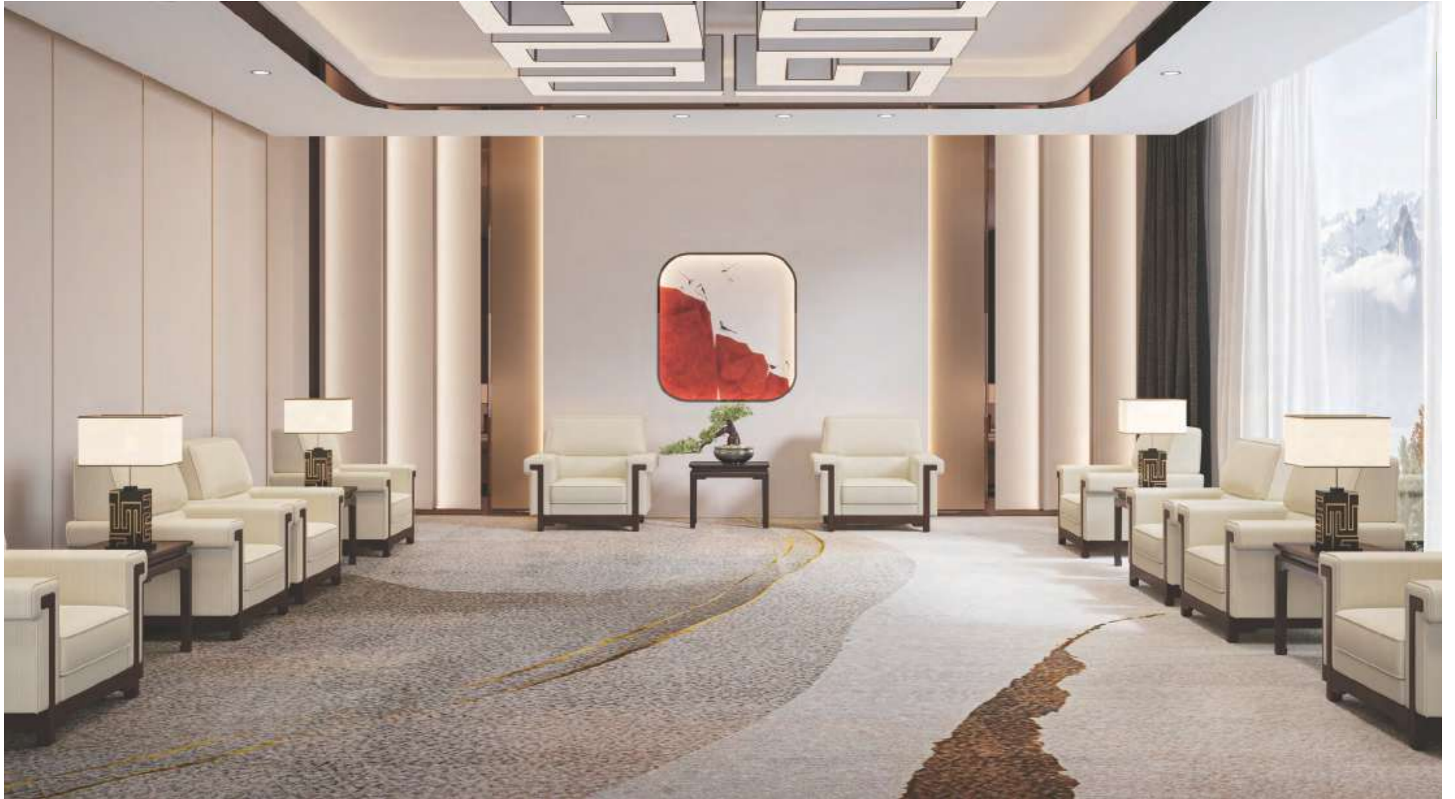
Have a glimpse of the traditional Chinese aesthetics.