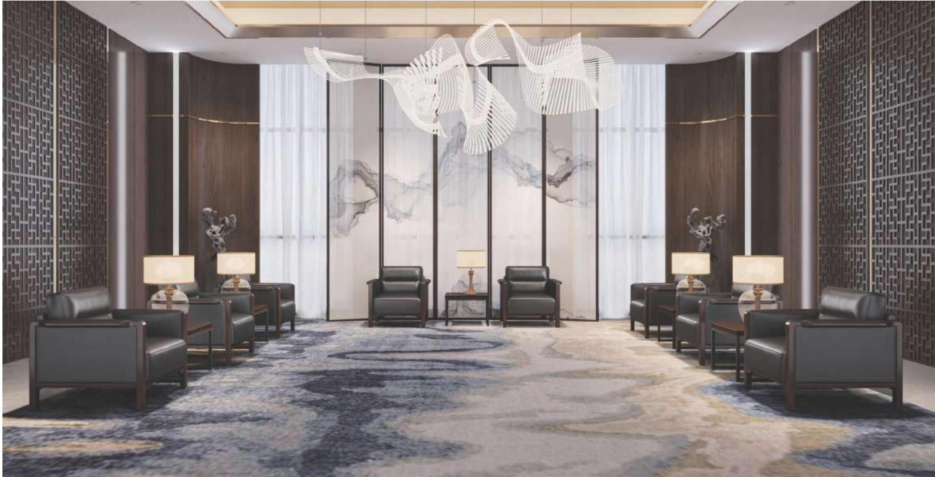
Glory-An artistic fruit of Chinese aesthetics.