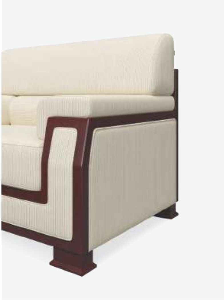
G2's recessed wood frame reflects the urbane and reserved temperament of a gentleman.