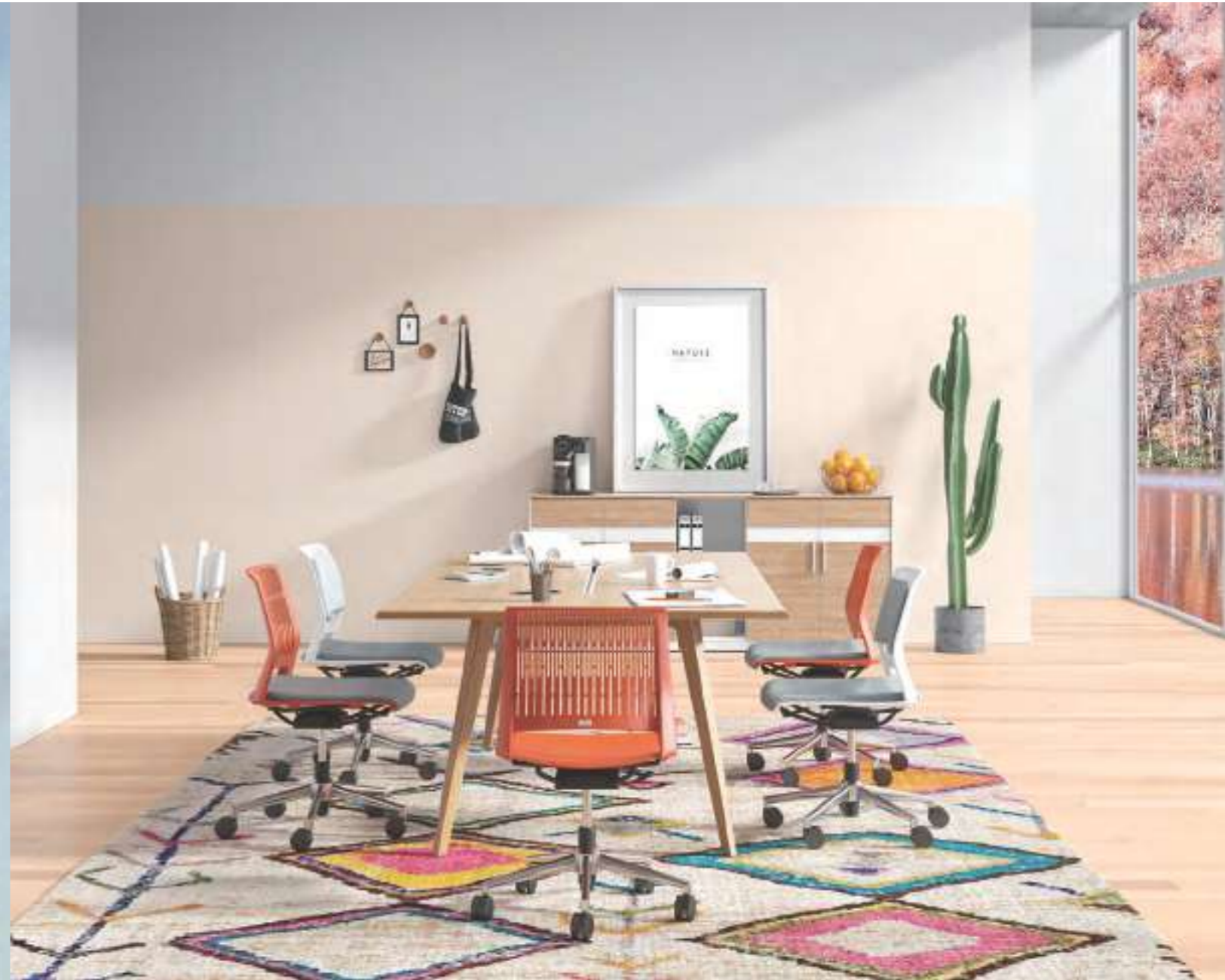
Orange as maples in the autumn.