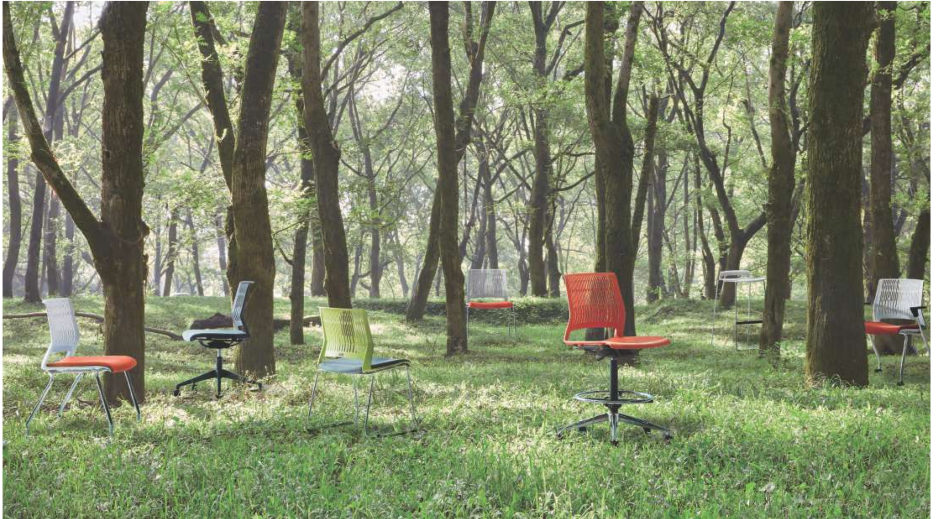
Magna - Genki Forest Chair