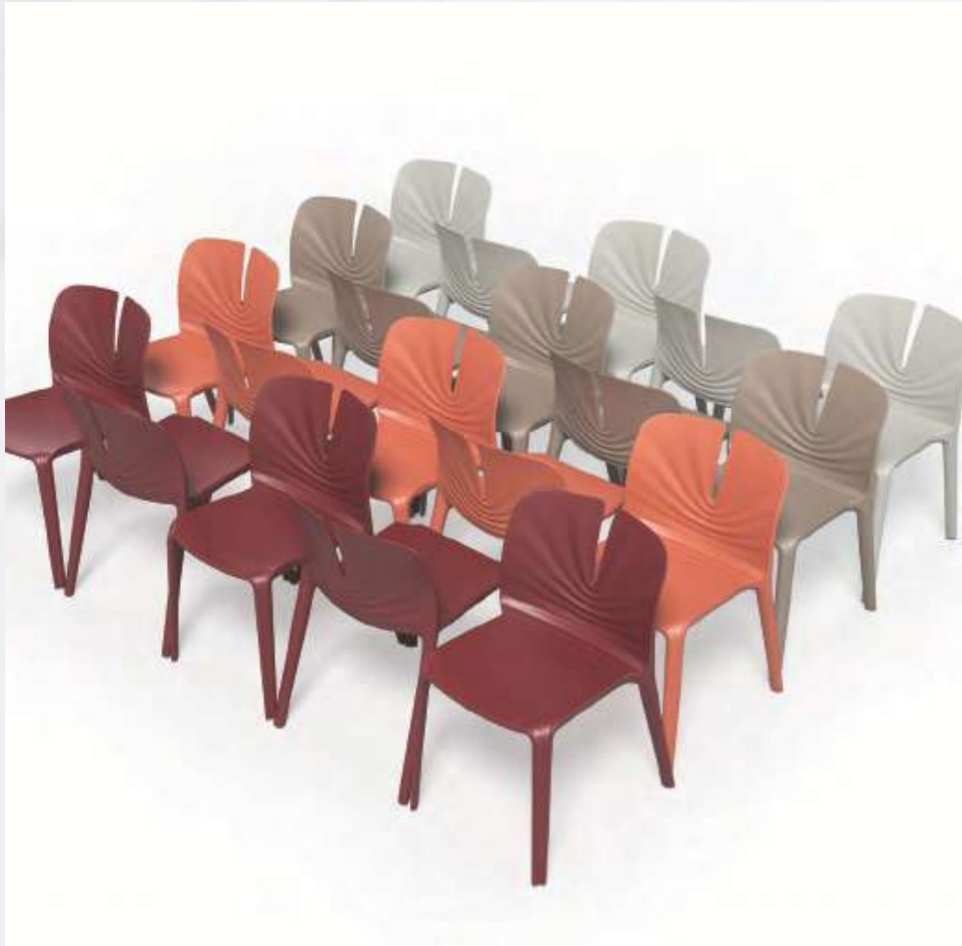
Blooming light and color