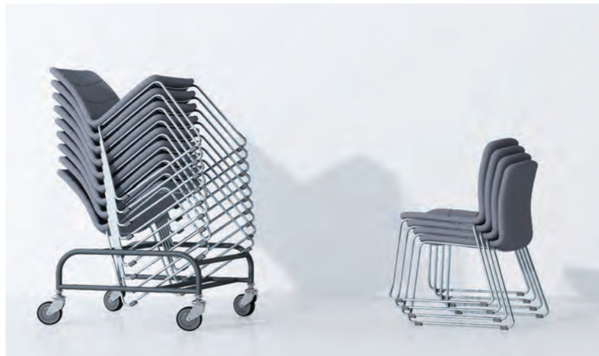
Storage is a form of art itself. Stacking is fun with Rachel's trapezoid legs. Pile up Rachel chairs casually to DIY your own artwork.